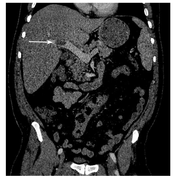
Figure 2. Computed tomographic scan of the abdomen showing a portal vein thrombus

His condition improved significantly, and three months after initiation of therapy (anticoagulant treatment and vitamin) the homocysteine level