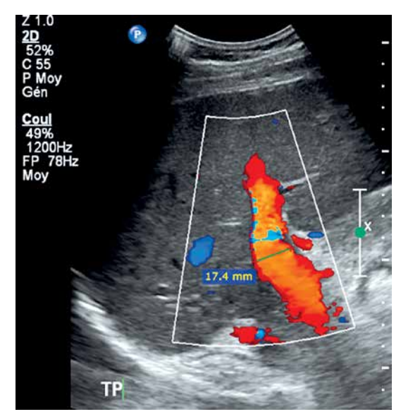
Figure 1. Ultrasonography showed a dilated and obstructed portal vein

The patient was diagnosed with acute PVT and was placed on anticoagulant therapy with low-molecular-weight heparin and acenocoumarol with a target INR of 2–2.5.